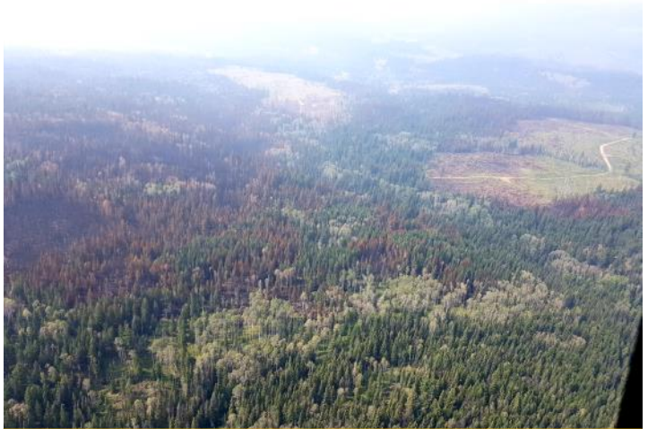
This photo is of the Young Lake fire yesterday afternoon (C42331).

Over the last week, much of the Cariboo Fire Centre experienced some reduced fire activity. We want to remind everyone that fires are still burning on the landscape. We expect to see the weather return to warmer and drier conditions in the coming week and that could cause an increase in fire behaviour again. For homes within the evacuation alert areas, please remain prepared for the potential increase in fire activity. We encourage everyone to take the necessary precautions to protect their homes and communities by participating in the FireSmart program.